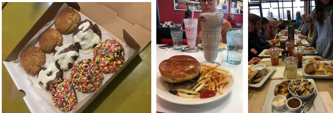
From left to right: Baked! Cookies, Steak 'n Shake, McAlister's Deli

There are food courts in almost every student housing, if not, there will always have a convenience store. The variety of cuisine ranges from local American food to Asian food at the price of around $10USD for a lunch meal which includes a dish and a drink. Apart from eating in school, there are a lot of restaurants nearby in Kirkwood (downtown) and College Mall too.